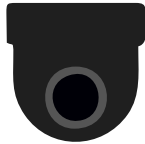
IP50 series (Multi Layered Deep Learning AI Analytics at Edge)