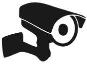
IP 30 series(intelligent video analysis at edge)