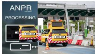
WVMS License Plate Recognition