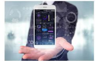
WVMS Mobile Application