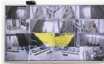
WVMS Enterprise – Wall & Redundancy