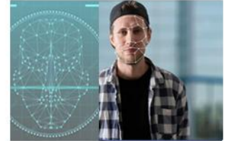
WVMS Facial Recognition Module