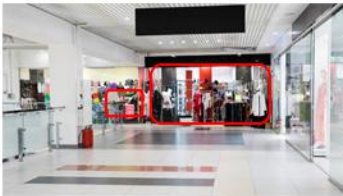
WVMS Video Content Analytics